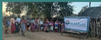
300 Blankets - AP, Odisha & Telangana