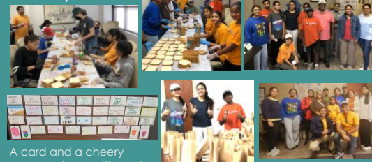
A card and a cheery message to go with each meal

Ekam Indy families donated supplies worth over $1000, and made over 60 snack bags and 1700 PBJ sandwiches for neighbors who use Horizon House as a day shelter