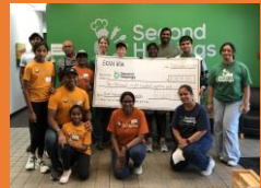
EYAs led a fundraiser for Second Helpings Pasta Push campaign, raising over $2800