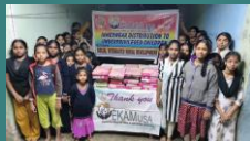
Innerwear and menstrual hygiene products (225 girls), AP & Telangana