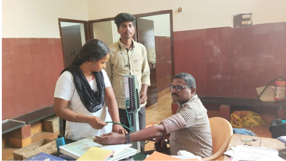
BP m/c in use