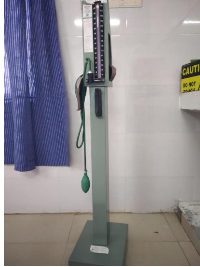
Standing BP m/c