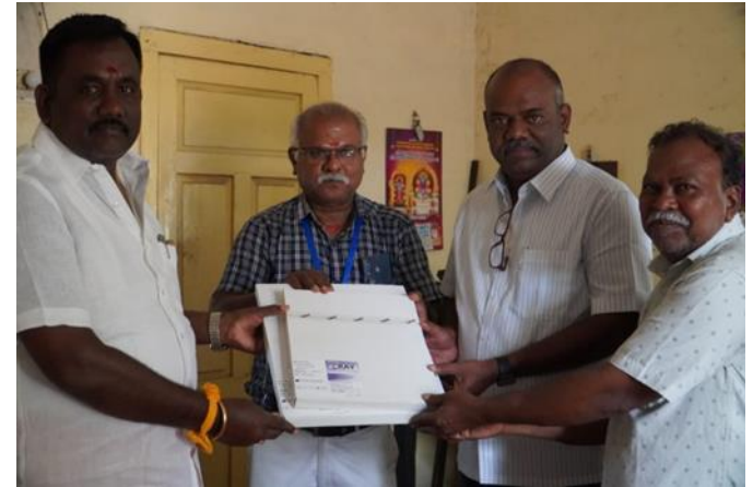
Delivery of supplies