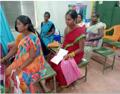
Benches for waiting room as pregnant women had to sit on the floor