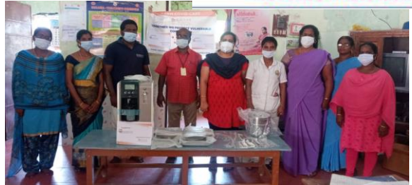
Delivery kit and oxygen concentrators for labor room